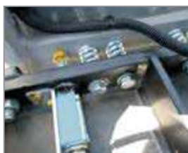
Safety: Boom position sensor, locking pin presence sensor