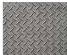
Anti-slip metal floor

* Reach reduced from 8365mm to 7625mm ** Cannot be transported on the machine