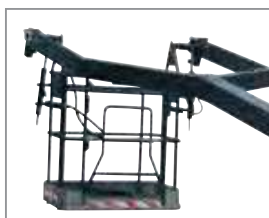
Pendular platform allows work under-bridges