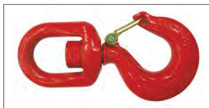
Safety: homologated self locking swivel hook