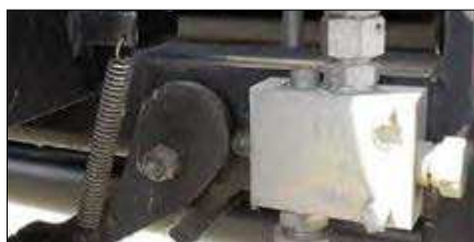
Safety: end of cable/ hook upper position automatic movement stop